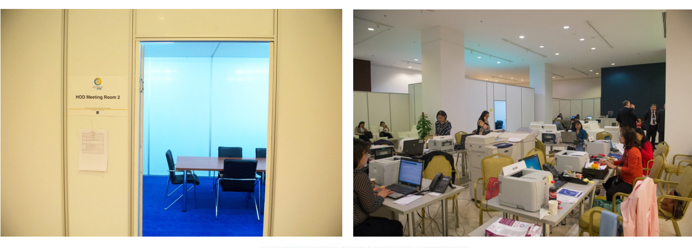
FORTY-SEVENTH ANNUAL MEETING (ASTANA) PALACE OF INDEPENDENCE Heads of Departments - Second Floor